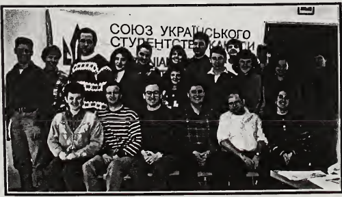
Delegates of CYCK Congress '93

Due to popular demand, the name of the CYCK official newsletter has been changed from Chutky to Novyny. This is not absolute though. If anyone has any suggestions for a better name, please let us know. We're willing to consider any contributions from you!