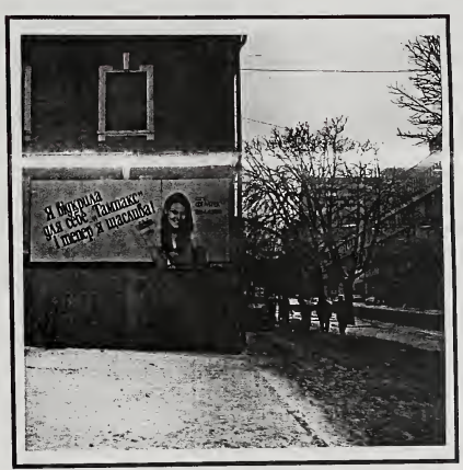
An ad found in Kiev on Lenin Street by the Fuji store. It loses something in the translation without explanation, so if you don't read Ukrainian, ask someone to explain!

The following are contributions from CYCK members that just don't seem to fit anywhere else! But, we love them, so if you have anything that is appropriate for this section, send it in!!