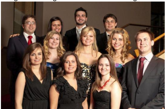
Members of the 2011/2012 SUSK Executive