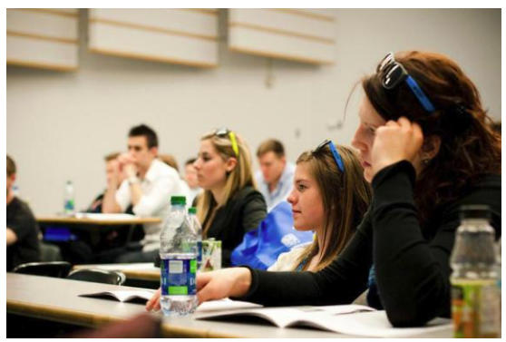
SUSK Delegates participate in sessions