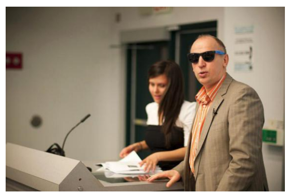
Ambassador of Ukraine, Ihor Ostach addresses SUSK delegates wearing limited edition SUSK Sunglasses