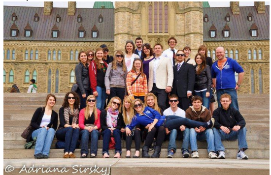
SUSK delegates after touring Parliament Hill