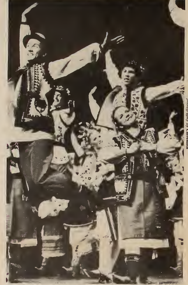
one of Canada's finest amateur Ukrainian dancing ensembles. As the male dancers returned to their initial pose within the frame, the audience was left breathless

Finally, a troup of troyista musicians introduced the final number in this set. Performers not only talented in dance but also in musical performance make up the Cheremosh ensemble. The prelude provided by the group displayed to Eastern audiences the strains of not-often heard tsymbaly and sopilka. As the musicians sauntered off, the company began a polka competition in the traditional setting of a barn dance. The traditional 'Kolomeyka' celebrating the new land and harvest was authentic — a mirror of weddings, dances and celebrations of Ukrainians across North America since the first pioneers set foot on this soil. Costum-