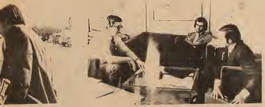
luyka outside CTV