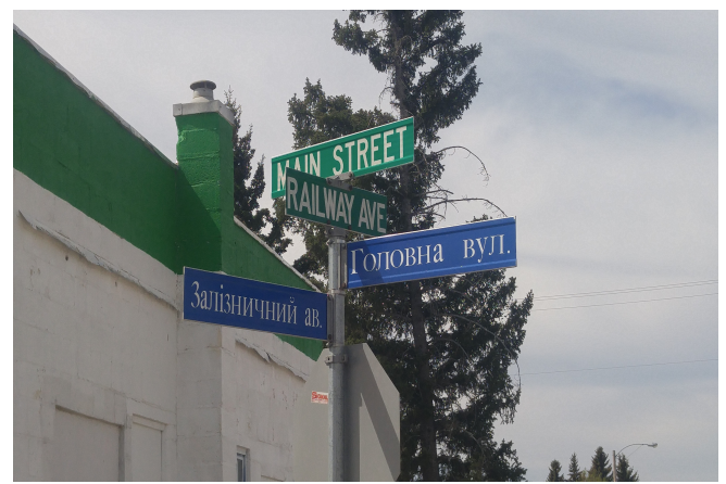
Historical Tour in Hafford, Saskatchewan – where bilingualism means both English and Ukrainian.